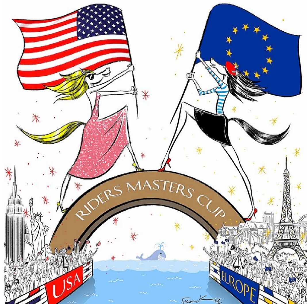
RIDERS MASTERS CUP

April 26-29, 2018 NYCB Live, Home of the Nassau Veterans Memorial Coliseum